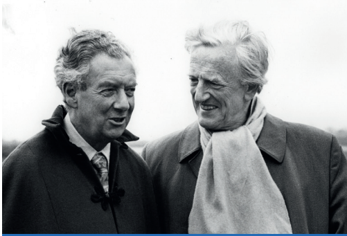
Benjamin Britten and Peter Pears, May 1975

Benjamin Britten was a composer born in Lowestoft, Suffolk in 1913.