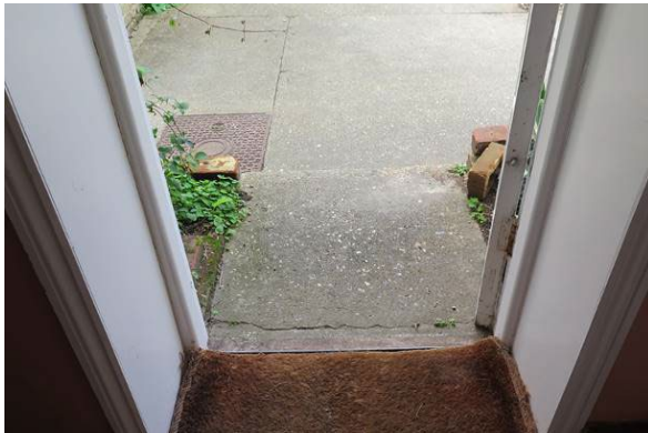
29 Drinks room exit