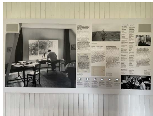
32 Interactive panel