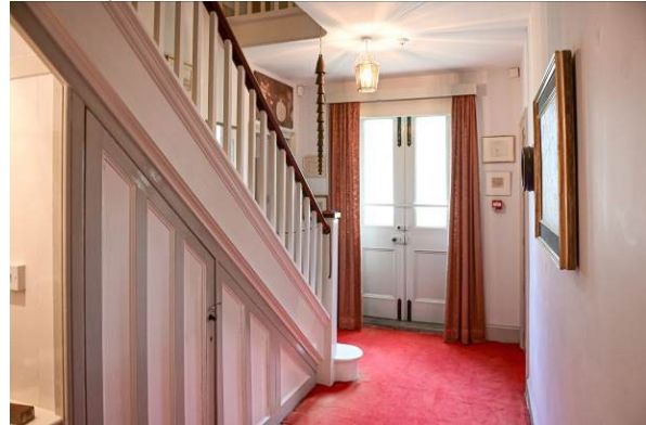
24 Corridor with original 1950s carpet