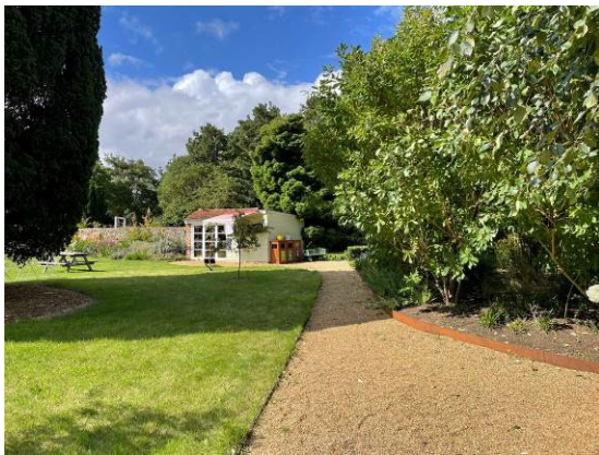
39 Path that leads to the Tea Hut

The Tea Hut is located at the end of the croquet lawn. There is a gravel path in front of it which leads to the Archive building and steps up to the tennis and croquet lawns (39). There is a hatch which opens up during visiting hours and is staffed by one person (40). There are bins to the side of the hut (41) and tables and chairs on the lawn nearby (42).