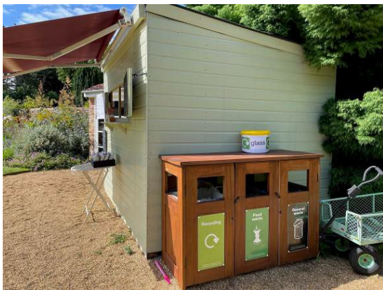
41 Bins on the side of the Tea Hut