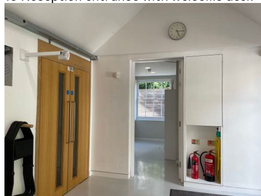
12 Entrance to the toilet block and lockers