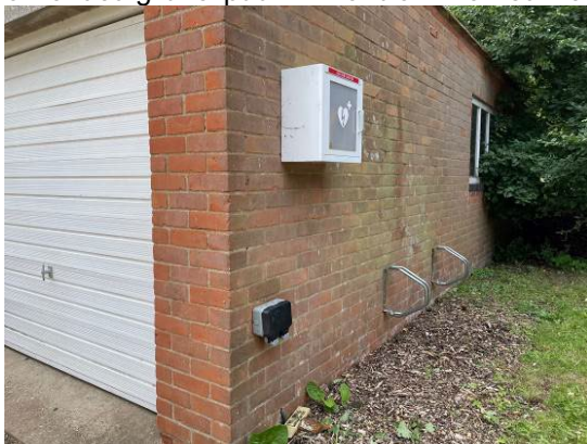
7 Bike rack at side of the garage