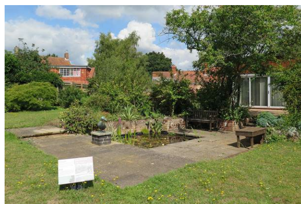
36 The pond surrounded by concrete paving