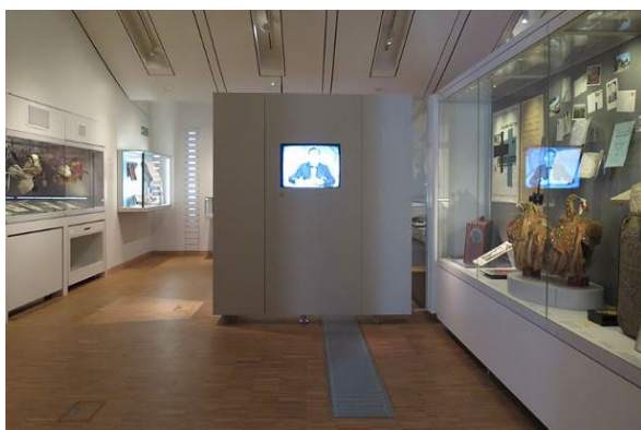
17 Timber flooring and metal air vents in gallery

There are two exhibitions within the gallery: the first about Britten's life and works, and another that changes every year. From the second exhibition there is a shallow slope with handrails on both sides that leads to the library (18).