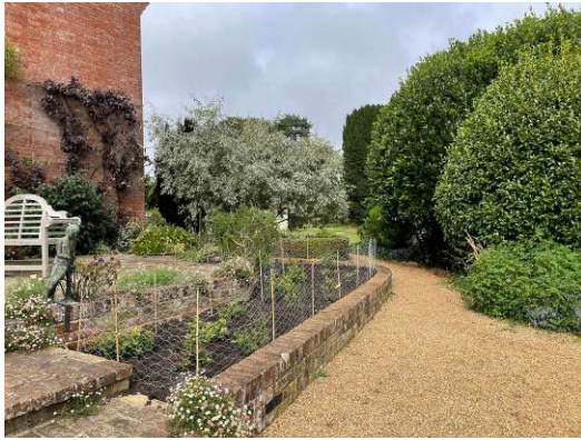
37 Gravel path that leads into the croquet lawn