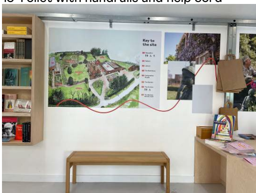
15 limited seating in reception