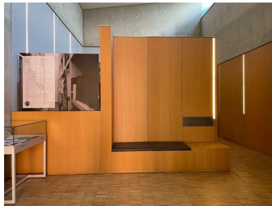
34 Archive foyer