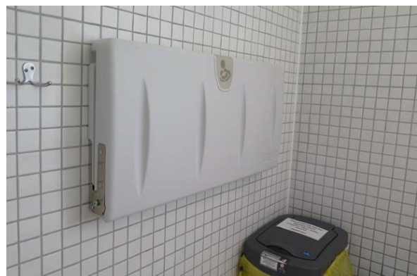
14 Baby changing unit in accessible toilet