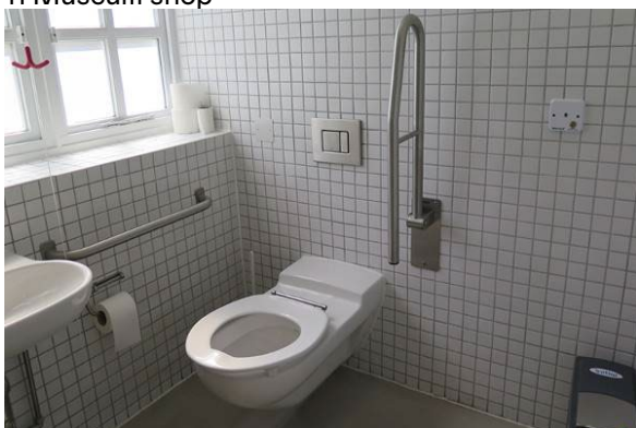
13 Toilet with handrails and help cord