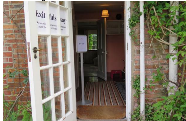
30 Drinks room exit from the courtyard

A lightweight, clean wheelchair with a 46cm (18") wide seat is available for visitors who are unsteady on their feet or have a wheelchair that is too wide to get through the front door.