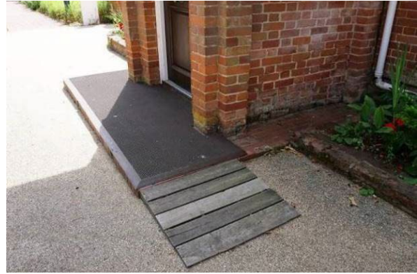
22 Ramp to front door of The Red House