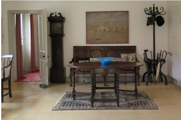
23 Entrance hall