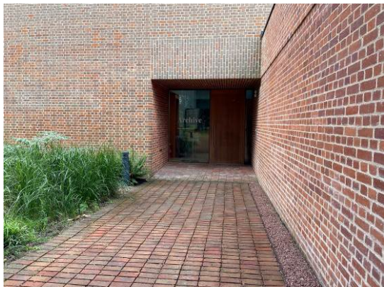
33 Archive entrance

The Archive is linked to the main site by a level brick path with a gentle slope into the building itself. It is open for talks Thursday to Saturday at 12:15, 14:00 and 15:00. Talks take place in the foyer and seating is available. Talks are included in the admission charge.