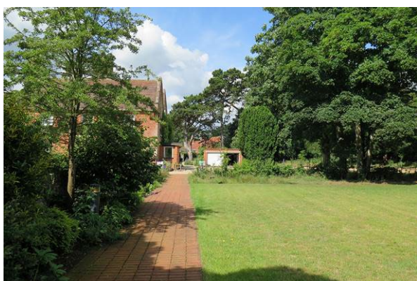
35 Brick path that leads to the house & Archive

The audio guide includes a narration of the garden.