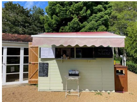
40 The Tea Hut