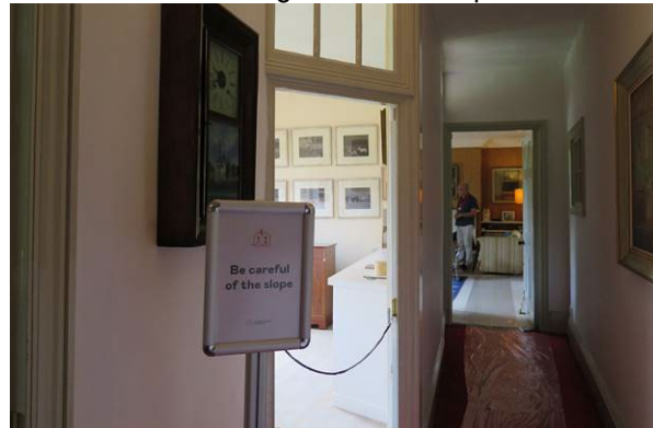
26 Breakfast room with safety signs

You can walk through the entrance hall, house gallery (27) and drawing room (28). The exit is at the drinks room (29) where there is a small step down into the courtyard (30).