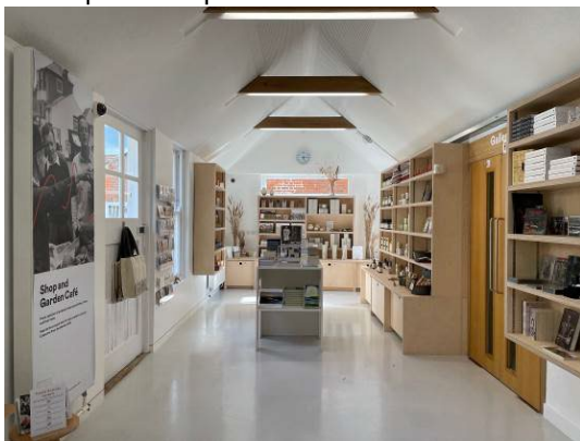
11 Museum shop