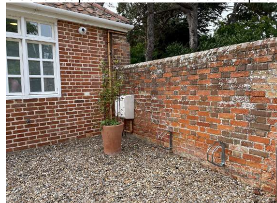
8 Bike rack in the courtyard

Reception is approached via a shallow ramp (9) and is level throughout. On arrival you will be welcomed by the team (10). This is where you buy or collect your admission ticket and start your visit.