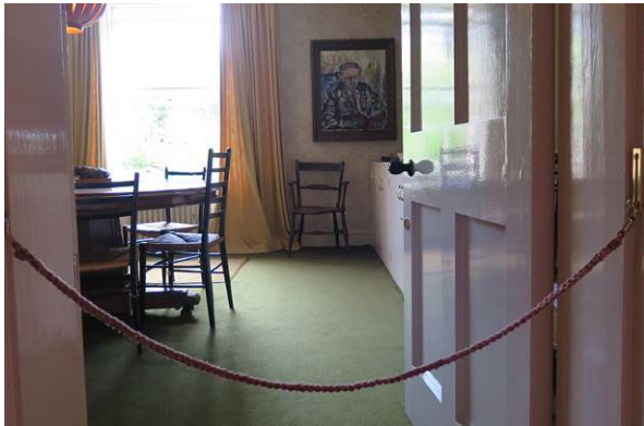
25 Cordoned off dining room