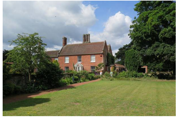
38 Grass tennis lawn

The Tea Hut is located at the end of the croquet lawn. There is a gravel path in front of it which leads to the Archive building and steps up to the tennis and croquet lawns (39). There is a hatch which opens up during visiting hours and is staffed by one person (40). There are bins to the side of the hut (41) and tables and chairs on the lawn nearby (42).