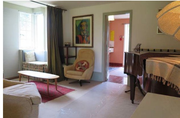
28 Drawing room which leads to drinks room exit