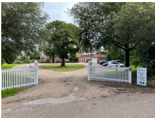
1 Main entrance car park

There is a second car park (2) with one reserved blue badge parking space and 16 other spaces (3). A bonded gravel path leads from this car park down to Reception in the courtyard (4).