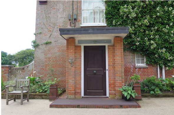
21 Entrance to The Red House

The House is presented as it was in Britten and Pears' time with original carpets and other furnishings (23). The ground floor has a combination of tight corners, slopes, small door frames and narrow corridors (24) that restrict the size of wheelchairs and walking aids that can go in the house. Part of both the dining (25) and breakfast (26) rooms are cordoned off.