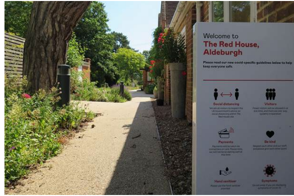
4 Level bonded gravel surface from car park 2

The drop-off point for taxis (5) is from the main drive which is connected to a bonded gravel surface. It then leads to a concrete path in the courtyard which leads to Reception (6).