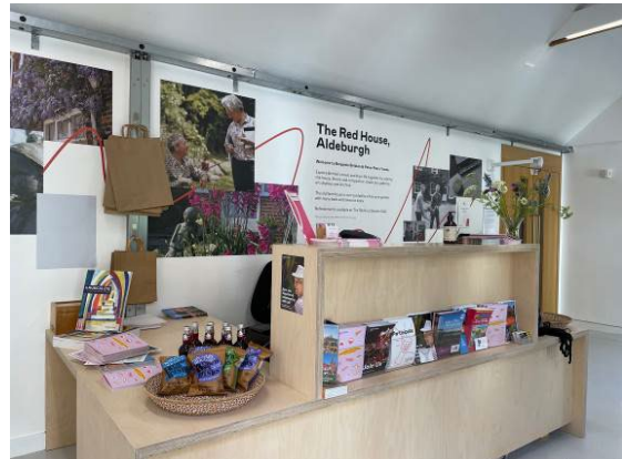
10 Reception entrance with welcome desk