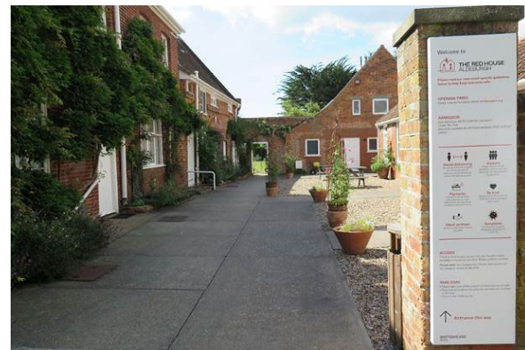
6 Concrete path from main drive to reception