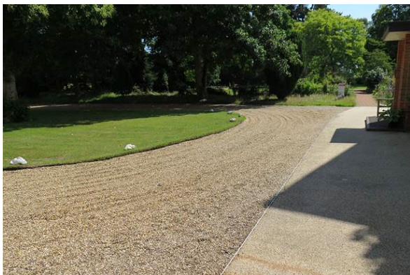
5 Bonded gravel path in front of The Red House

There are two areas for bike storage: one on the side of the garage (7) in the main car park and the courtyard (8).