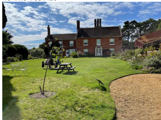
42 Tables and chairs