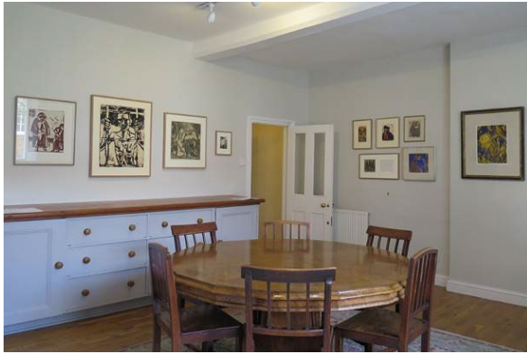
27 View of the gallery room in the House