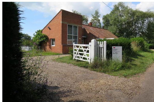
2 Car park 2 entrance