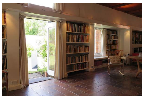
20 Library exit leading into the garden