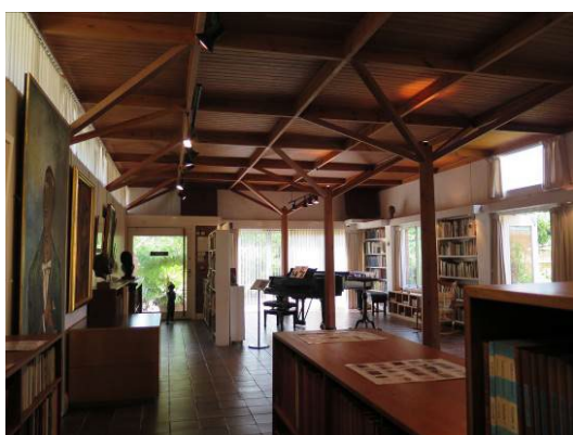
19 View of library from the entrance

The library (19) was designed for Britten and Pears in 1964 on the site of an old cow shed, and is level throughout with a tiled floor. Please note that space is restricted within the room because of the layout of furniture and the piano. From here, you can exit into the garden (20) through French doors and a ramp which leads on to a grass lawn.