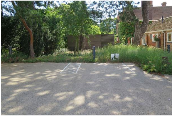
3 Blue badge parking space in car park 2