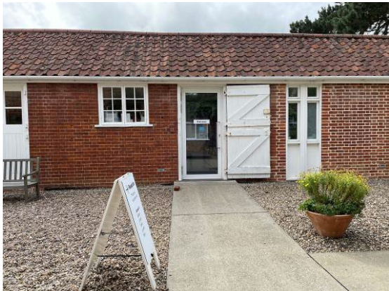
9 Ramp to reception

There is limited seating in reception for visitors (15). There is a water fountain available with cups and has a spout to fill a water bottle (16).